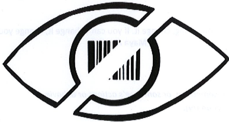
ACCESS LOGO. Copyright Cara Simpson